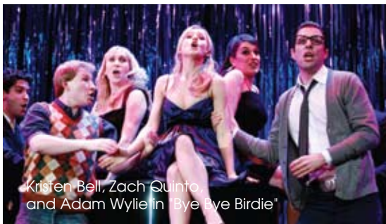
Kristen Bell, Zach Quinto, and Adam Wylie in "Bye Bye Birdie"