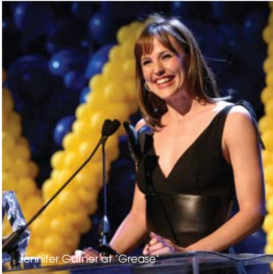
Jennifer Garner at "Grease"