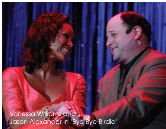
Vanessa Williams and Jason Alexander in "Bye Bye Birdie"