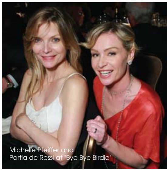
Michelle Pfeiffer and Portia de Rossi at "Bye Bye Birdie"